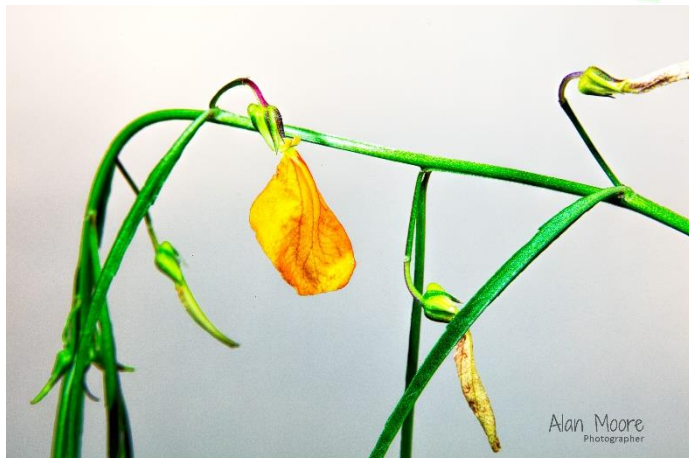
Using light to highlight colour & form – Spade Flower