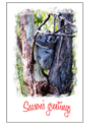
A6 Koala card