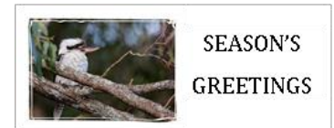
DL Kookaburra card