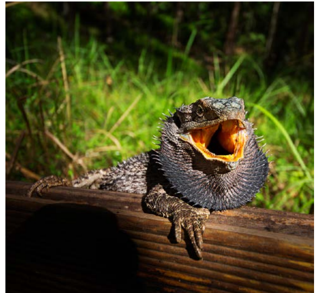
Eastern Bearded Dragon Pogona barbata

The workshop venue is among trees at Fox Gully Bushcare site within Mt Gravatt Conservation Reserve.